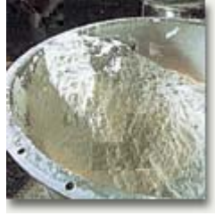
Figure 1.2 Harvested Starch

Starch when harvested is turned into a white, granular product. According to the Australian Academy of Science, “starch can be processed directly into a bioplastic, but because it is soluble in water, articles made from starch will swell and deform when exposed to moisture, limiting its use”(Packaging Greener, 2004). The starch must be transformed into an altered polymer in order to solve the issue of starch deformation. Biodegradable starches can be processed “using conventional plastic technologies such as injection molding, blow molding, film blowing, foaming, thermoforming and extrusion” (Mohanty, 2004). These starch-based plastics resemble many conventional plastics and are as, “biodegradable as pure cellulose”.