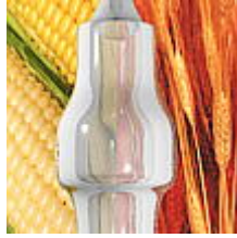
Figure 1.3 Injection molded PLA

packaging, board lamination etc.), stationery (pens, cartridges, pencil sharpeners etc.), and personal care items” (“Green Plastics”, 2004).