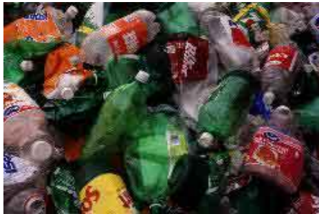
Figure 1.7 Bottles are still wasted with recycling

With all of the advantages of biodegradable plastics, there are a number of disadvantages. Recycling helps the environment and it works well for many plastic containers such as bottles.