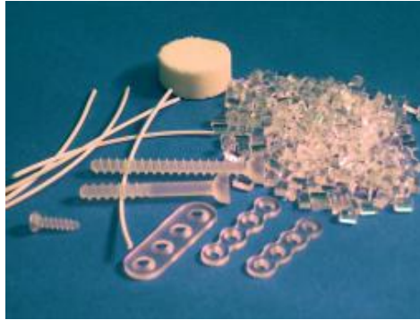
Figure 1.6 Plastic polymer parts