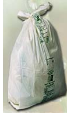
Figure 1.4 Biobags can be used for trash and compost disposal

A potential re-use feature of the Biobag and other starch-based composites is that they can be used as feed for farm animals. Some animal feeds are required to contain some starch along with 13-24% protein (“Green Plastics”, 2004). Starch-protein plastics were used for food containers from fast food restaurants. They could then be pasteurized into animal feed, rather than sending the starch-based trash into a landfill, cutting costs in many areas of society.